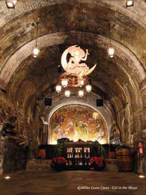
© Miller Coors Caves - Girl in the Moon